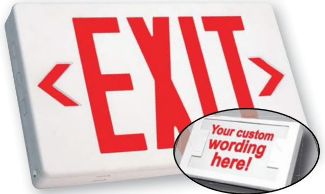
Custom Signage Available