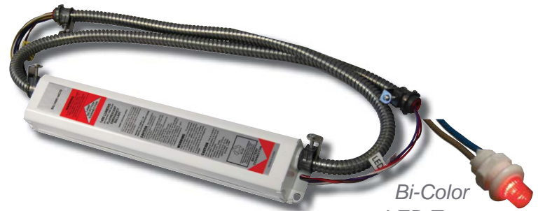
Bi-Color LED Test switch included.