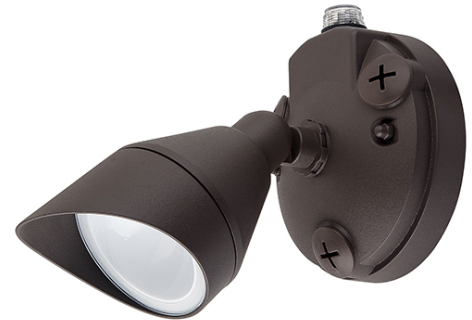
Model ELEDOSEC-3-PCMS-BRZ (3 heads, motion sensor & photocell, bronze finish)