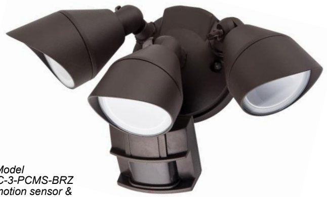
Model ELEDOSEC-3-PCMS-BRZ (3 heads, motion sensor & photocell, bronze finish)