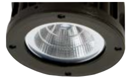
Shown with "D" Narrow Optic