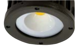
Shown with "A" Medium Optic