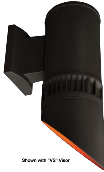
Shown with "VS" Visor

Warranty: 5-Year Warranty for -40°C to +50°C Environment.