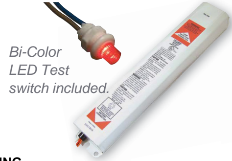
Bi-Color LED Test switch included.