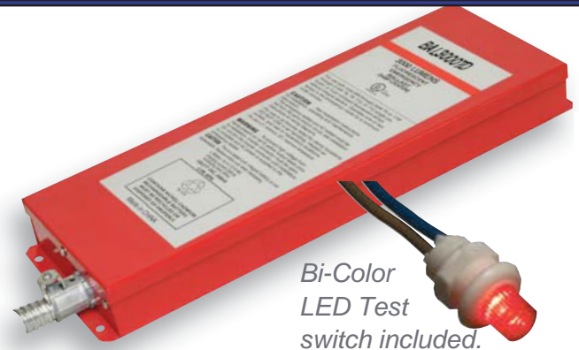
Bi-Color LED Test switch included.