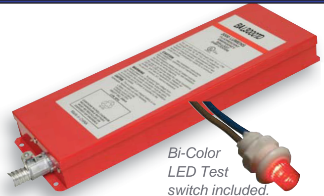
Bi-Color LED Test switch included.