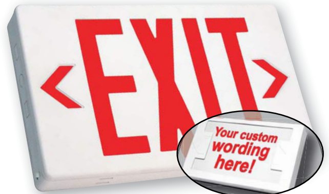
Custom Signage Available